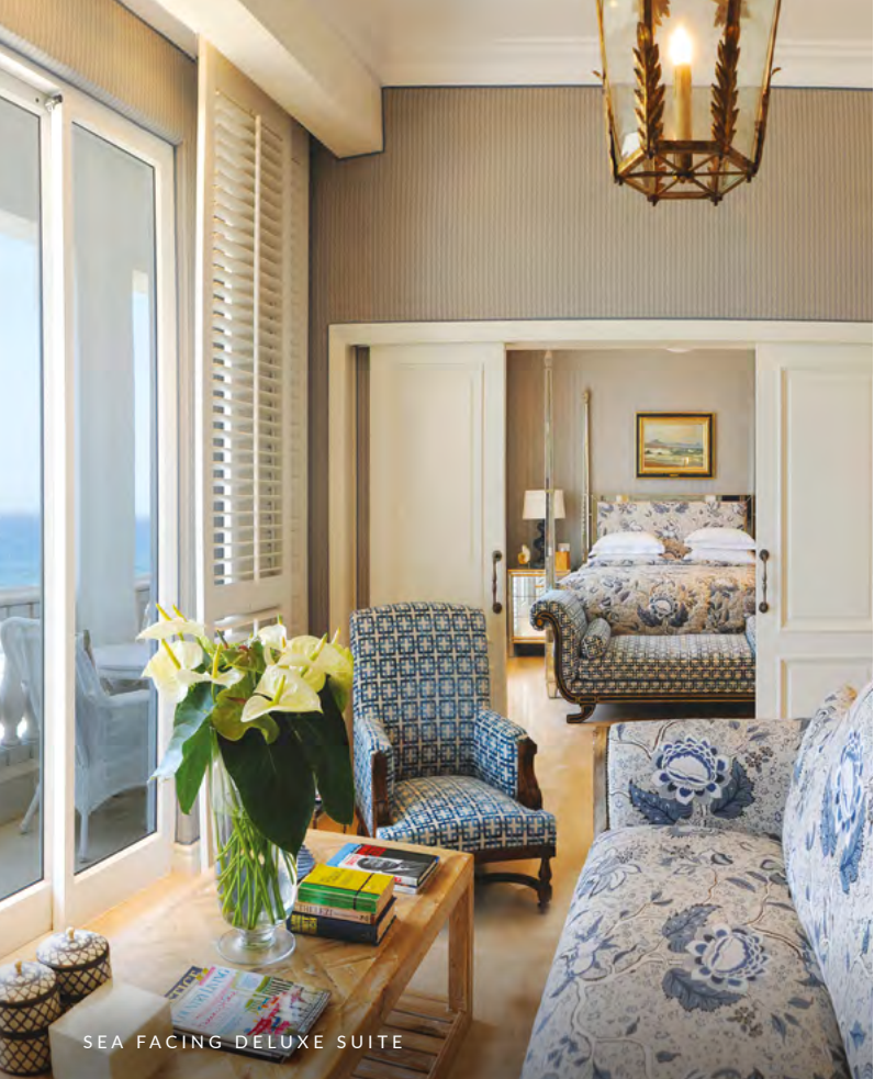
SEA FACING DELUXE SUITE