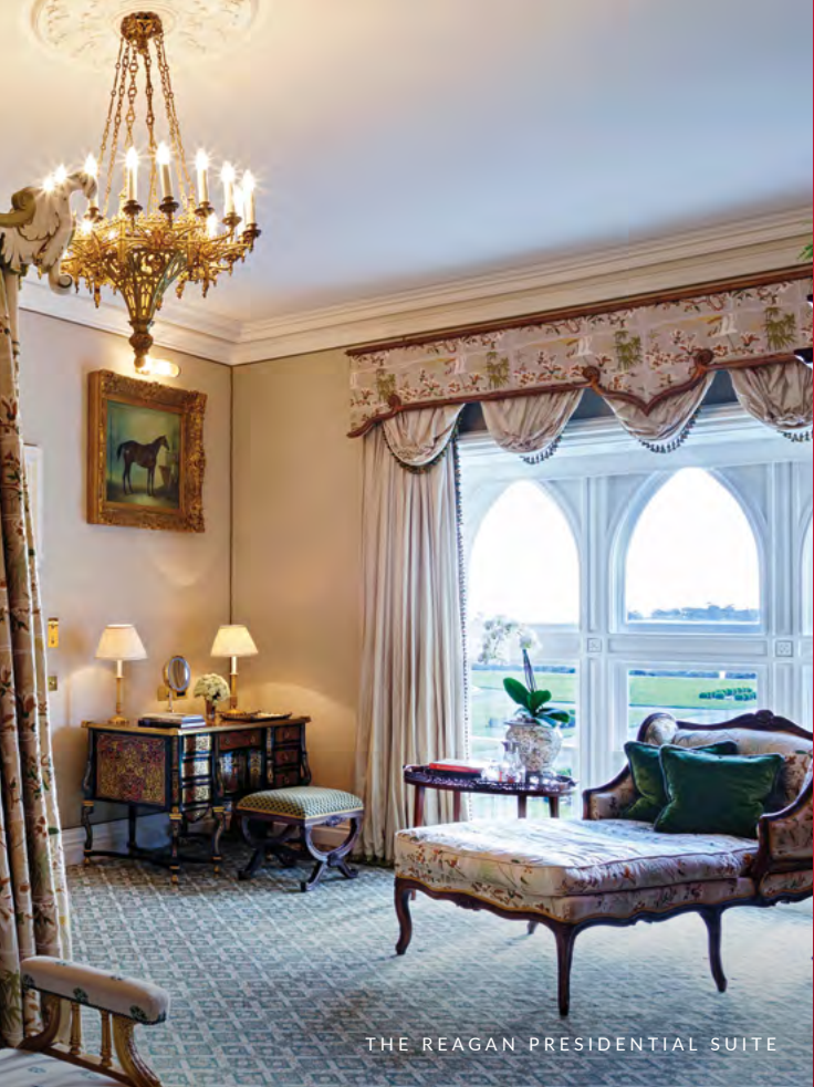
THE REAGAN PRESIDENTIAL SUITE