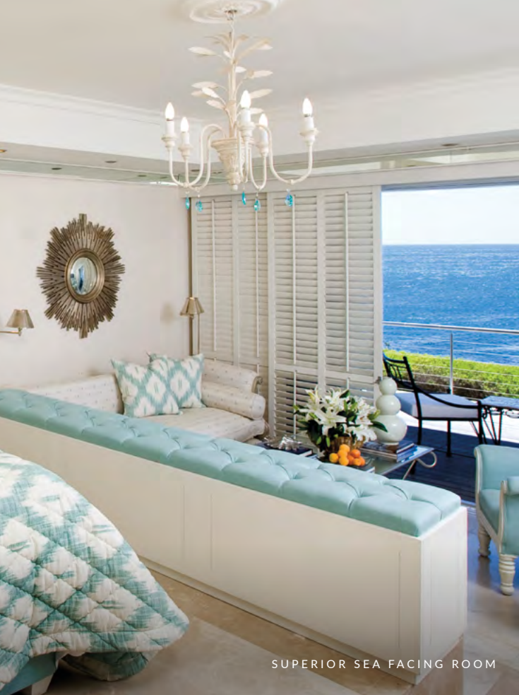
SUPERIOR SEA FACING ROOM