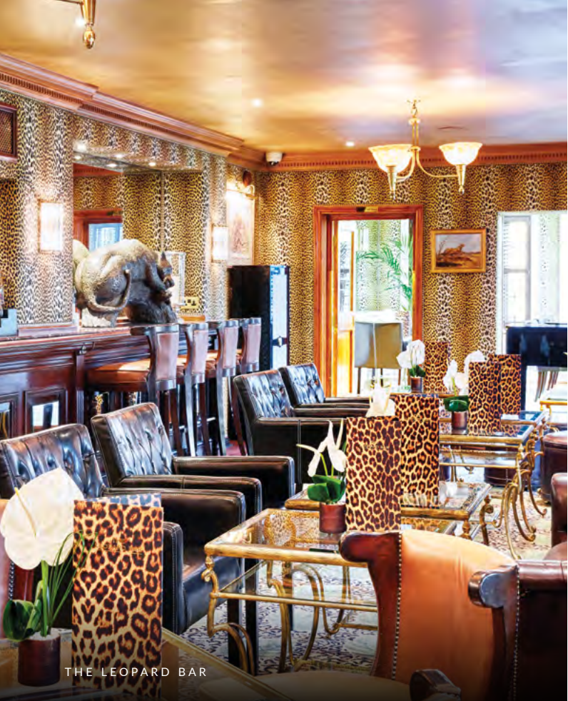
THE LEOPARD BAR