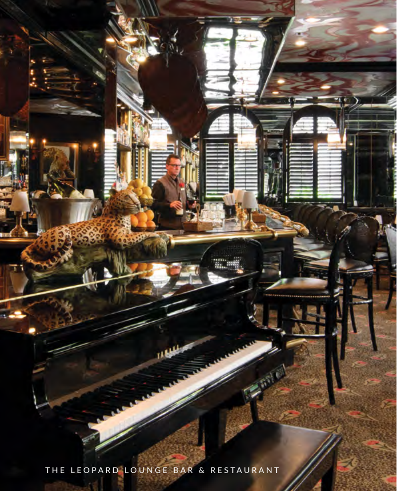
THE LEOPARD LOUNGE BAR & RESTAURANT