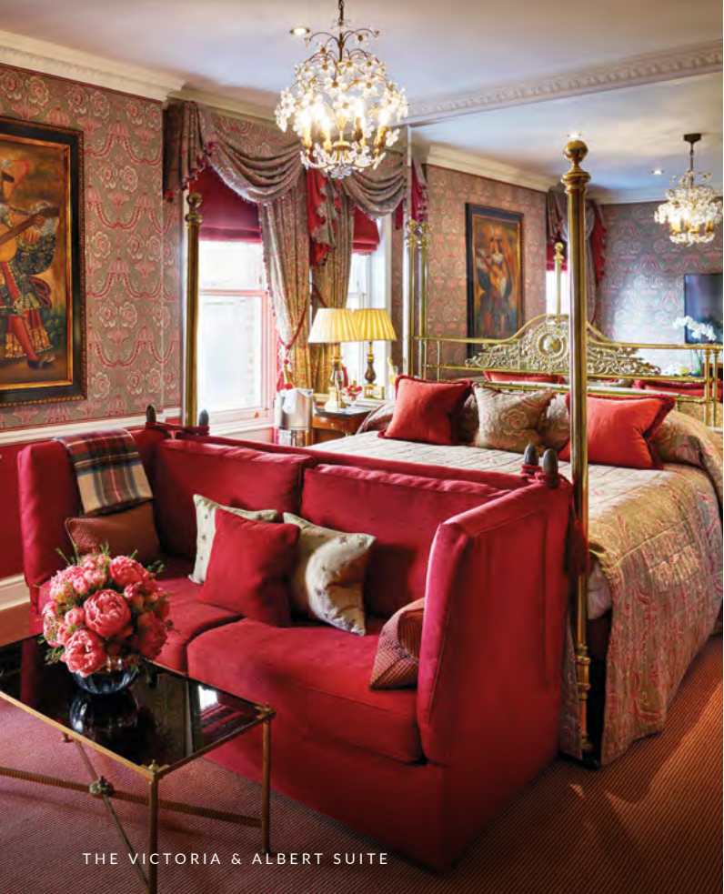
THE VICTORIA & ALBERT SUITE